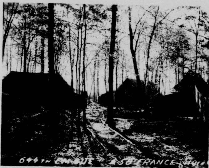
Squadron Areas - 158 France.