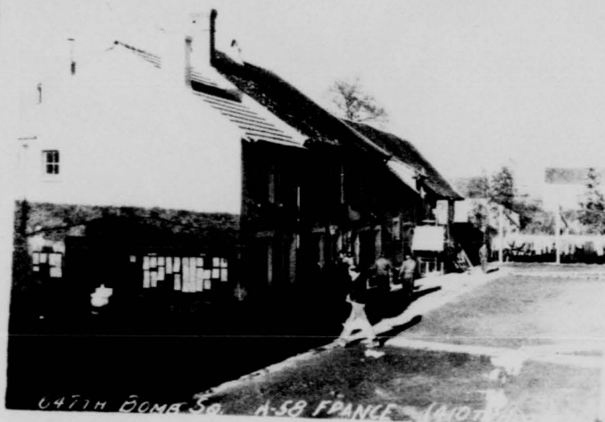
64TH Bomb Sq. A-58 France (410th Hst)