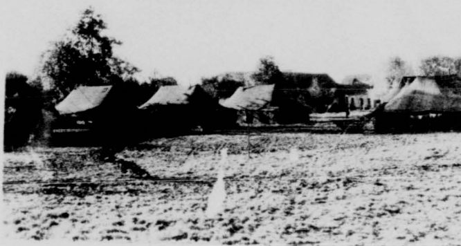
Squadron Areas - A-58 France.