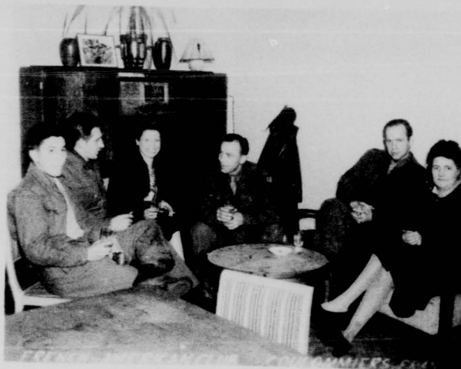
French American Club, Coulommiers, France.