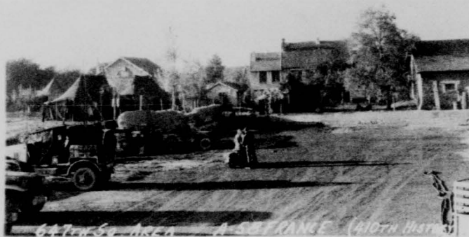
64TH Bomb Sq. A-58 France (410th Hst)