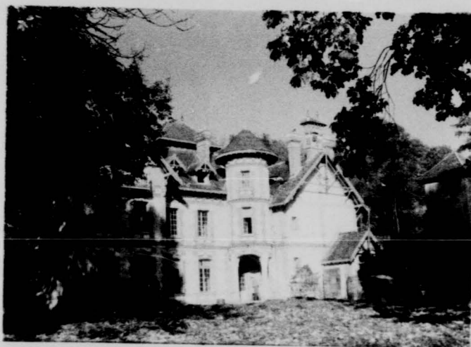
410th Group Headquarters - A-58 France