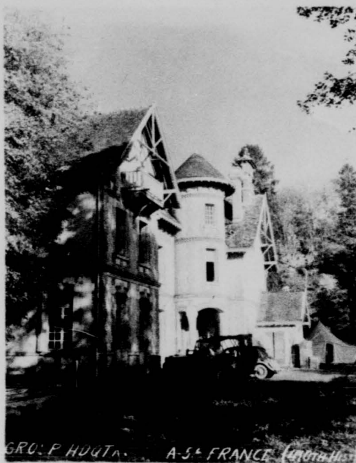
GRO: P. HUQT. A-58 FRANCE (MONTMARTRE)